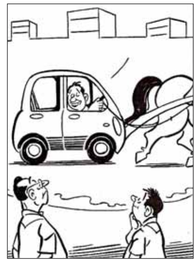
This one is far cheaper than 'nano'!

A cartoonist needs to be abreast of happening around the world so that to capture those moments and blog correctly in the column as Cartooning is the journalism through pictures. They have to be unbiased so that their creativity is not hampered. "If you are powerful enough people will themselves