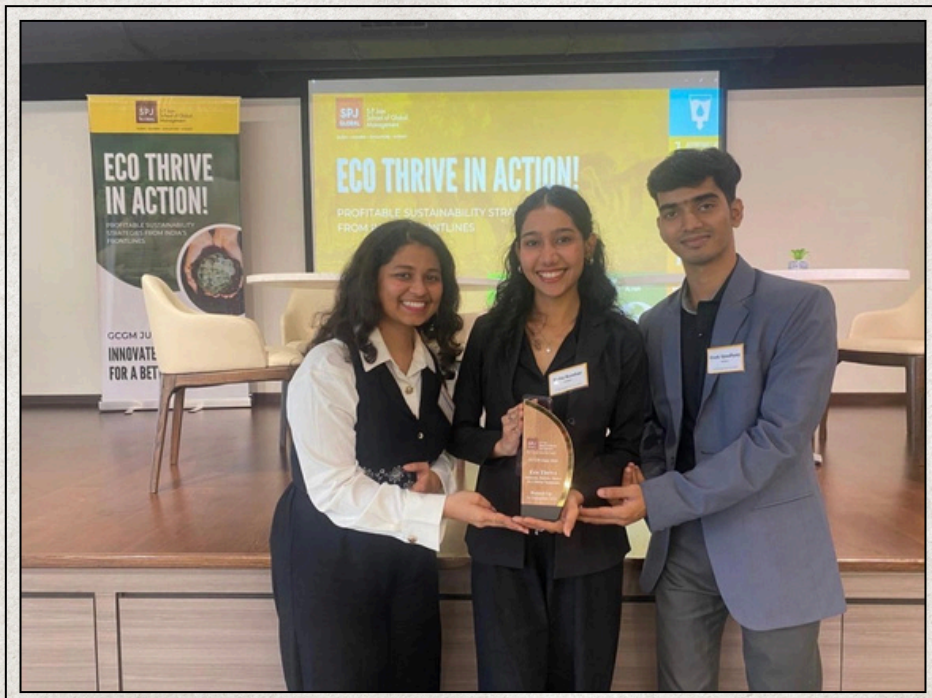
TEAM ANTARA 2 ND RUNNER UP AT ECO-THRIVE 2025 ORGANIZED BY SP JAIN SCHOOL OF GLOBAL MANAGEMENT