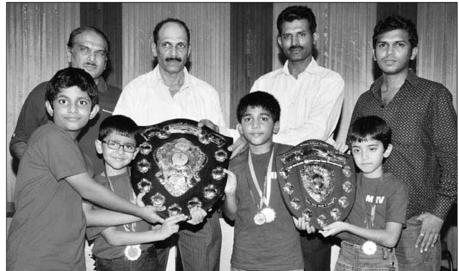
Rishikul Vidyalaya students receiving the 13th Smt. Susheela Vaze Rotating Chess Trophy, in Inter-School Chess Team Championship, organised jointly by Dr. Prakash Vaze Sports Foundation and Maharashtra Seva Sangh, Mulund.

While A K Joshi English Medium School, Thane, Fr. Agnel Multipurpose School, Vashi and Gopi Birla memorial School, Walkeshwar also did well to scalp the title in 10th Std, 6th std & 4th Std categories respectively. More than 600 students took part in the tournament.